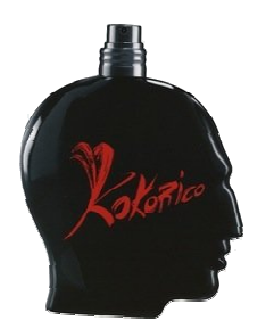
Kokorico by Jean Paul Gaultier Woody notes of Patchouli, Cedar and Vetiver express their masculinity.

Warm wood notes of Vetiver, Cedarwood and Sandalwood combined with Spices and sensual Ambergris, Musk and Labdanum appeal to the primal instinct within all men.