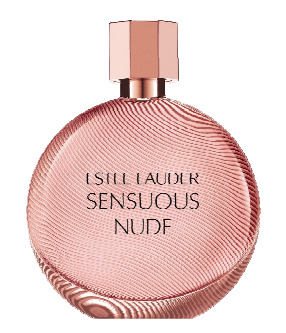
Sensuous Nude by Estée Lauder Musk, Sandalwood and Vanilla combine in this feminine scent.

Violet Blonde by Tom Ford The powdery notes of Orris and Violet blended with sensual flowers.